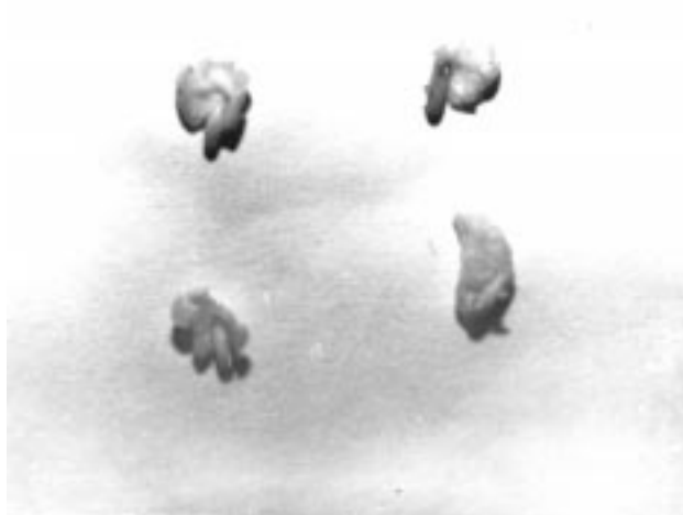
Figure 1. Isolated Tilia platyphyllos embryos.