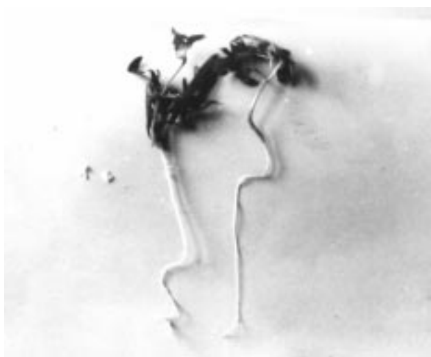
Figure 3. Plantlet regeneration on MS medium with 30 g/l sucrose after four weeks of the culture.

of hypocotyls and root length growth was observed on the media where embryos of the seeds were cultured about one month after harvesting (Table 2). In development of embryos cultured up to a month after the harvesting of seeds, hypocotyl and root length growth increments were high, but decreased thereafter.