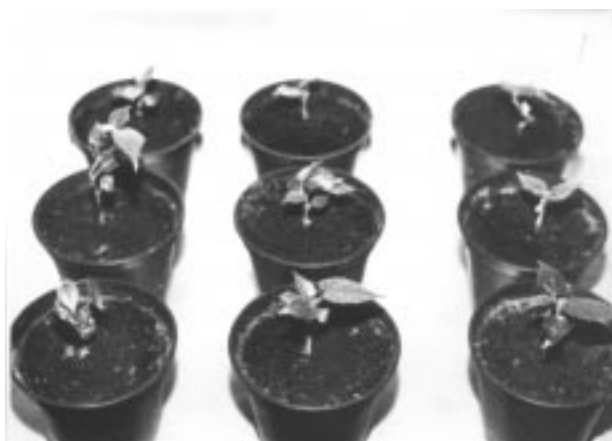
Figure 5. Plants (2 months old) regenerated on sucrose media and transferred to pots.