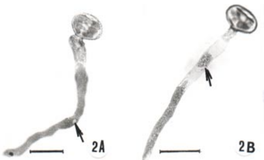
Figure 2. A) Two large nuclei (arrow) germinated in culture and appearing inside the pollen tube in the 2 nd hour. B) Four small nuclei (arrow) inside the pollen tube. Bars = 25 µm.

male gametophyte might not occur. As far as has been noted, while some of the pollen tubes had two large nuclei (Figure 2A), some had four small nuclei (Figure 2B). Hindmarsh (1964) noted that in diploid plants, the generative cell was divided inside the pollen tube.