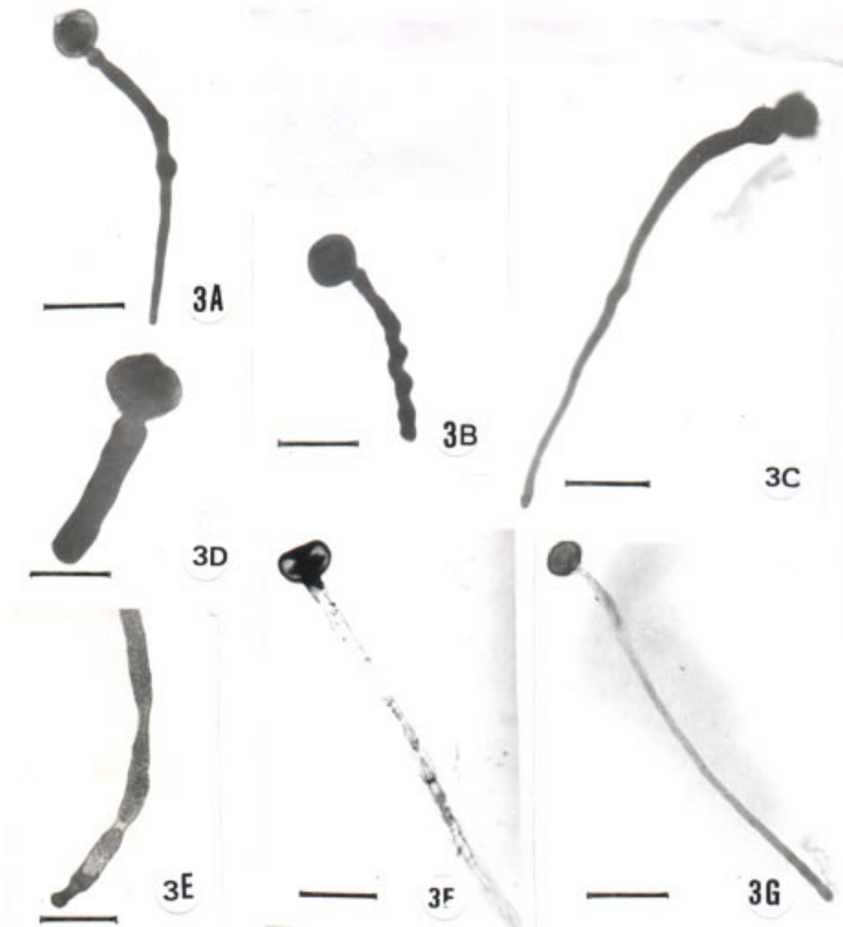
Figure 3. Abnormalities observed in pollen growth in tetraploid T. pratense . A) A bifurcated monosporic pollen tube. B) A pollen tube with a wavy structure. C) An abnormally grown pollen tube due to cytoplasm deposition and wall swelling. D) An abnormal pollen tube with thickened walls. E) A pollen tube with callose formation at its tips. F) Callose plugs formed in pollen tube cytoplasm. G) A poorly grown pollen tube. Bars = 25 \mu m.

as fertile ones, sterile pollen grains are also observed in in vitro medium (60-70%). In some of the germinated pollens, besides the observed bifurcation (Figure 3A) and wavy structures (Figure 3B) in the pollen tubes, some