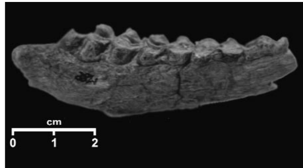
Figure 1. D. majus (PUPC 86/2): Right mandibular ramus with P 4 -M 3 ; buccal view.

All the cheek teeth are well preserved and show the pronounced morphology. PUPC 86/2 (Figure 1) is a well-preserved right mandibular ramus having P 4 -M 3 . The