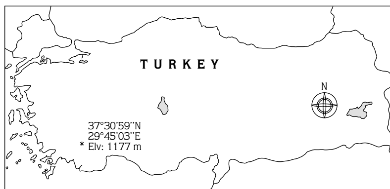
Figure 3. Locality of the specimen.

Grissel (1995) stated that discovery of additional species of Idarnotorymus might help verify or alter its generic status and might also be helpful in resolving questions concerning the relationship within the clade. By