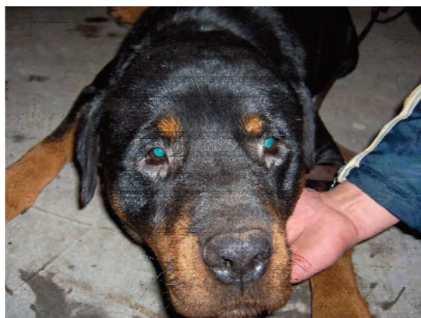
Figure 2. Case 2. Periocular alopecia, blepharitis, and nasal hyperkeratosis.