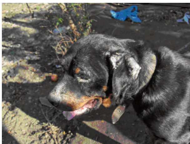
Figure 1. Case 1. Alopecia on the ears, nasal and auricular hyperkeratosis, conjunctivitis, and blepharitis.

Secondly, serum samples were analysed by the indirect fluorescent antibody technique (IFAT) to detect parasite-specific antibodies. IFAT was performed using whole antigen promastigotes of Leishmania infantum MON1 (MHOM/GR/78/L4), a strain isolated in Greece (National Reference Centre for Leishmaniasis, Hellenic Pasteur Institute, Athens, Greece). The parasites were cultured in DMEM (Gibco) supplemented with 10% FCS (Seromed) at 25 °C. The IFAT was carried out as