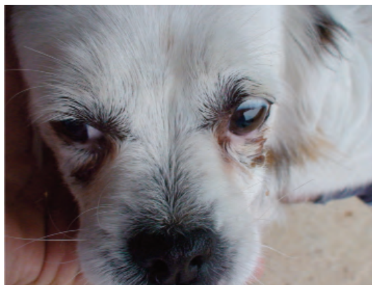
Figure 2. Bilateral draining tracts are present just beneath the eyes.

An 8-year-old female Pekinese was presented due to bilateral draining tracts located just under its eyes, which had been treated with local anti-inflammatory ointment and systemic antibiotic for about 3 weeks prior to presentation. The lesions sealed temporarily, but they returned once medical treatment was discontinued. Dark swollen spots with small draining wounds were located on the skin just beneath the eyes (Figure 1). It was apparent that the discharge originated from some structure ventral to the eyes and was traveling up under the skin and below the lower eyelids. Clinical examination revealed normal heart rate, respiratory rate, and rectal temperature. The dog's general condition, appetite, CRT (capillary refill time), and hydration status were also normal, with no signs of systemic sepsis. Oral examination revealed that the teeth were not loose or painful on palpation, and no sign of periodontal diseases was observed. Carnassial tooth root abscesses were suspected. Dental radiography was performed to determine the source of the abscesses and the extent of tissue damage. It was confirmed that both maxillary fourth premolar teeth had radiolucent periapical lesions around their roots (Figure 2). The dog was