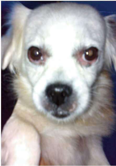
Figure 3. The dog 6 months following extraction of the maxillary fourth premolar teeth.

pulp exposure allows oral bacteria to migrate from the tooth fracture site into the pulp tissue, and then through the apical foramina of the root apex into the alveolar bone and deeper bony structures. Usually, the abscess breaks through the skin just below the medial canthus of the eye (7). This is often the time that endodontic disease is observed by the owner, as most dogs and cats do not show any outward signs of disease. Endodontic and periapical disease can be treated either by root canal therapy or tooth extraction.