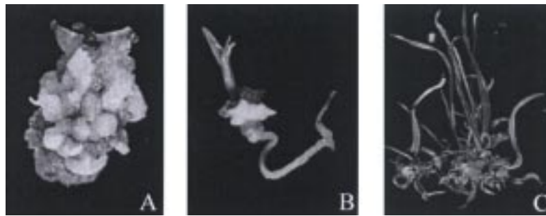
Figure 1. Tissue culture stages of Zafer 160 barley. (A) Embryogenic callus (B) Somatic embryo (C) Plantlet regeneration (Gözükırmızı et al., 1990).

In 1992, the plant biotechnology group in TÜBİTAK started investigating molecular markers using RAPD techniques. Tissue culture regenerated plantlets were tested for stability (Gözükırmızı et al., 1992), methods were developed for hybrid selection from wild lines and cultivars of barley ( Hordeum vulgare cvs. Kaya, Quantum, Tokak, Yerçil and Cumhuriyet) and these hybrids were characterised by random amplified polymorphic DNA assay. DNA isolated from parents and F 1 hybrids was amplified using 10 base long primers. Hybrids giving selective banding patterns from both the cultivars and wild parents were taken as real hybrids. This technique is convenient for plant breeders since it is rapid, sensitive and inexpensive (Arı et al., 1995). At this time wild type barleys originating in Turkey were being obtained from gene banks, and using these seeds a DNA bank was established and DNA fingerprinting studies were performed for the first time in Turkey (Gürel & Gözükırmızı, 1998; Albayrak & Gözükırmızı 1999).