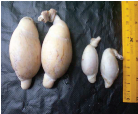
Figure 2. Smaller testes of a buck with bilateral testicular hypoplasia (right) and full-sized testes (left) from a buck of comparable age.

adult plain white (Borno white) Sahel goats was 24.7 \pm 5.3 kg. Kwari et al. (4) reported ages and weights of Sahel bucks at slaughter as 1.0-1.5 year and 11.5-24.5 kg, respectively. Mature adult weights of Sahel bucks were variously reported as 30-40 kg (3), 26.8-28.2 kg (16), and 25-37 kg (17).