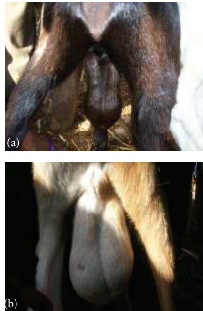
Figure 1. Posterior view of 2-year-old Sahel bucks with small-sized hypoplastic (a) and full-sized normal (b) testes in their scrotal sacs.

This study has shown the pattern of culling in relation to the coat colours, ages, and body weights of the bucks. The majority (65.7%) of goats presented for slaughter were white and black-white ecotypes. A low percentage (3.3%) of the population attained optimal mature weight at slaughter. Most of the bucks (91.2%) were brought to the abattoir at >1.5-3.0 years of age with mean weights of 15.6-25.7 kg. Mohammed and Amin (15) reported that the mean mature weight of