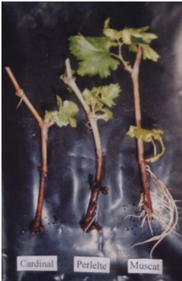
Figure 1. Root formation in the cuttings ( Vitis vinifera cvs. Cardinal, Perlelte and Muscat).

during the experiment are shown in Table 2. The enzyme activity showed a similar increase in all three grape varieties from the early stages. PPO activity increased from the outset in the Muscat cuttings, reached its highest level on the 40 th day and then decreased in the following days. In the Perlelte cuttings, the enzyme activity started to increase from the early stages and the highest increase was observed on the 35 th day. The enzyme activity increased continuously from the 5 th to the 50 th day in the Cardinal cuttings (Figure 2).