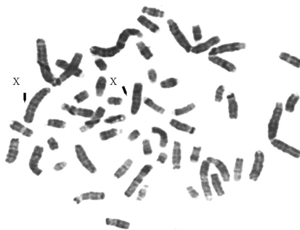
Figure 1. G-banded chromosome spread of sheep ( Ovis aries ).

Each metaphase cell was examined at 100 × magnification under oil immersion. A G-banded chromosome spread of Lohi sheep is illustrated in Figure 1. The diploid chromosome complement was