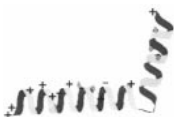
Figure 1. Schematic representation of structure of cecropin A. Taken from Holak et al. (1998). The position of charged (+/-) and polar residues are indicated.

Fish are one of the organisms that have managed to survive in a milieu of pathogenic organisms (19). The primary interference of fish with their environment happens through a mucus layer that covers their entire body. Research has demonstrated that the mucus layer is composed of biochemically diverse secretions from epidermal goblet cells and epithelial cells (16). It was reported that epithelial tissues produce antimicrobial molecules which serve as the first line of a host's defense against microbial invasion in a variety of vertebrates including humans (18).