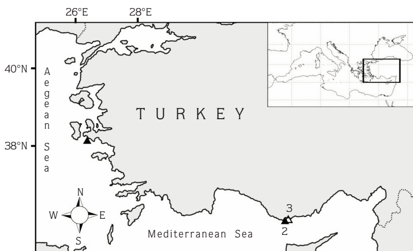
Figure 2. Map showing the locations of the stations where the specimens were sampled (triangles denote presence of V. granulata , empty triangle B. philippiana ).