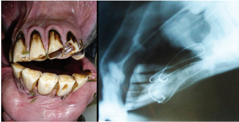
Figure 3. Clinical appearance and radiographical view of the case on the last follow up examination. Fracture healing was determined and rostral malocclusion due to unconscious mastication during the postoperative awakening.

In the postoperative first follow up day, it was observed that some sutures were open or the sutured soft tissue defect was torn and food particles were entrapped in the oral lesion. Because of this, saline lavage was performed 3 times a day within the defects and the food particles were removed. An oral antiseptic was used to prevent possible bone infection. The oral wounds become smaller and then healed within 7 weeks following this application.