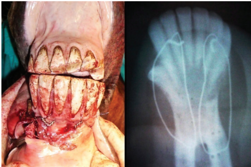
Figure 2. Postoperative clinical and radiographical views of the case following the operation.

An obvious malocclusion on the rostral side occurred because the fracture line was exposed to mastication forces, due to the horse's unconscious jaw movement during the postoperative awakening period. However, the malocclusion did not affect the jaw closure because the occlusion of the mandible was a normal caudal to the symphysis (Figure 3). It was decided that surgery was necessary to correct the rostral part malocclusion. The horse started to use the jaw functionally within 24 h after the surgery.