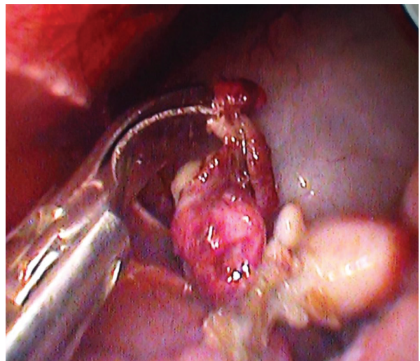
Figure 3. Cutting and coagulation of paraovarian cyst.

Diagnosis of an ovarian cyst is quite difficult due to the lack of specific symptoms and signs. After diagnosis of the cyst, the treatment decision regarding the surgical approach depends on the size of the cyst, its location in the abdominal cavity, and eventually the surgeon's level of experience in minimal access surgery. Paraovarian cysts are usually small in size and single, and bilateral cysts have also been reported in human females (5). In the present case we also found bilateral cysts in a female rhesus macaque. The left paraovarian cyst was 5-6 cm in size,