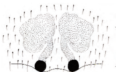
Figure 2. Female epigynum, ventral view (Scale line = 0.25 mm).