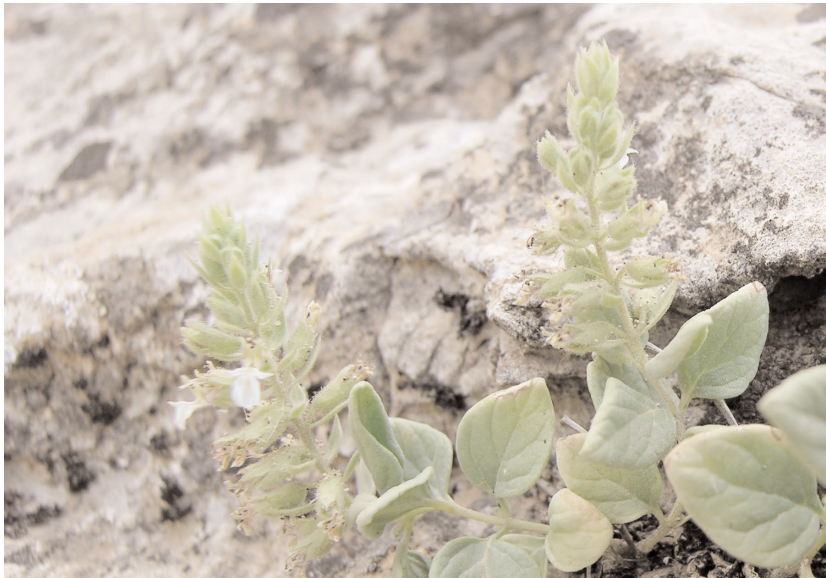
Figure 2. A view of Teucrium chasmophyticum on the limestone crevices.

The species is known as only a single specimen of the type gathering and the second location around Gölgelikonak village of Eruh-Siirt (Figure 3). The Turkish population of the taxon is found on the rock crevices of the area and it is not under considerable threat. In consideration of both localities, I propose the "CR" category (IUCN, 2001) for this chasmophytic taxon. The specimens of the taxon are kept at HUB.