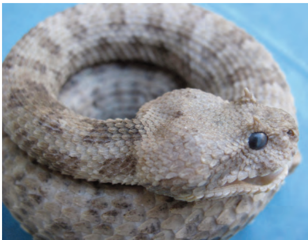
Figure 2. Female specimen of Pseudocerastes fieldi from southern Iran