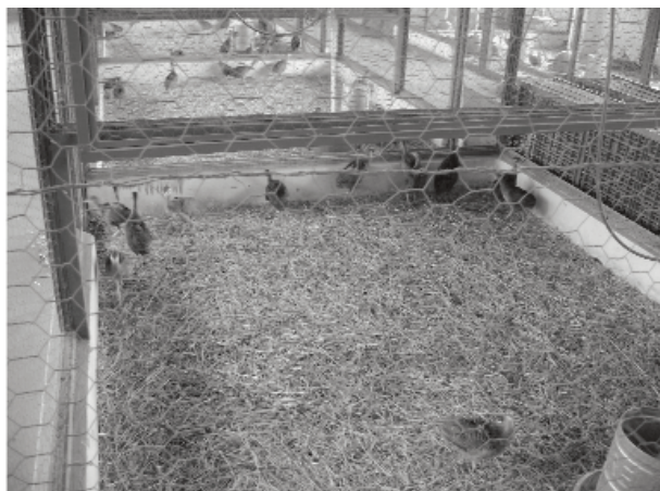
Figure 1. Tinamou housed in pens with a glimpse of the sand run on the right.

the domestication of the tinamou has become economically important. Raising tinamous in an environment similar to the chicken results in good performance of growth rate, excellent carcass and breast yields, and perfect adaptation to meal and pelleted feeds (Cooper, 2009). The breeding of this bird in captivity, though, is problematic. Cocks and hens only take together during the mating season. Under natural conditions the breeding season commences in September and comes to an end in March. The hens are polyandrous, mating with 2-4 cocks. The hen lays ca. 25 eggs/season and the cock incubates them and takes care of the young. The cock's sexual potential could be improved in the presence of a dominant hen as they could exhibit a more pronounced domination. However, the cock is not always able to exhibit its reproductive potential in order to attract and stimulate hen oviposition. Thus, housing harems of one cock and several hens does not seem to improve reproduction (Cromberg et al., 2007).