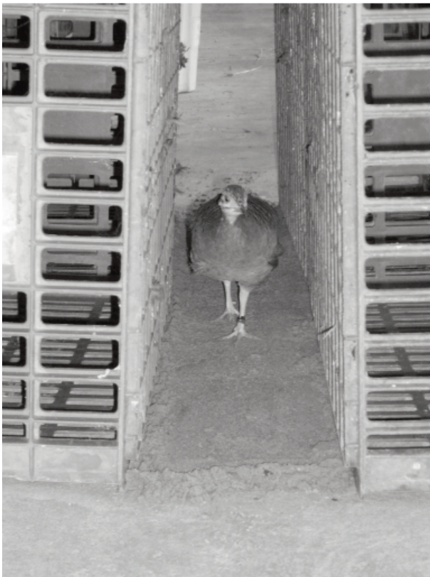
Figure 3. Adult tinamou on sand run.

Data were analysed statistically using the General Linear Models (GLM) procedure of Statistical Analysis System (SAS®) software (SAS 9.1, SAS