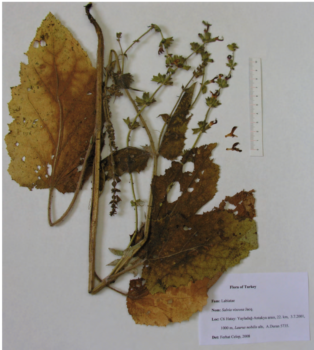
Figure 1. Habit of Salvia viscosa .

Perennial herb. Stems erect, 50-80 cm, below densely eglandular villous with some short glandular pilose hairy. Basal leaves ovate to ovate-oblong cordate at base, membranous, 14-20 × 8-10 cm, more or less papillose-pubescent, margins irregular dentate-erose. Lower leaves long-petiolated, 11-17 cm, densely eglandular villous, middle and upper leaves short-petiolated or sessile. Inflorescence widely branched panicle, inflorescence axis densely glandular pilose (viscid) with some eglandular