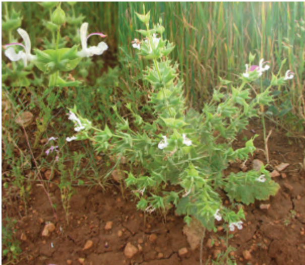
Figure 1. View of Salvia macrosiphon .

New Locality: C8 Diyarbakır: Mardin to Diyarbakır, 14 km before Çınar, 759 m, field edges, lat 37°39'16"N, long 40°28'21"E, 24.05.2007, A. Kahraman 1382 (Figure 2).