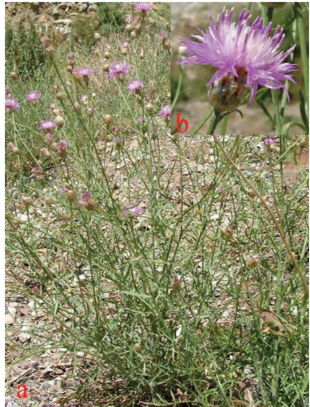
Figure 2. a. Habitat of Centaurea aziziana in Güzeldere Pass; b. Capitulum.