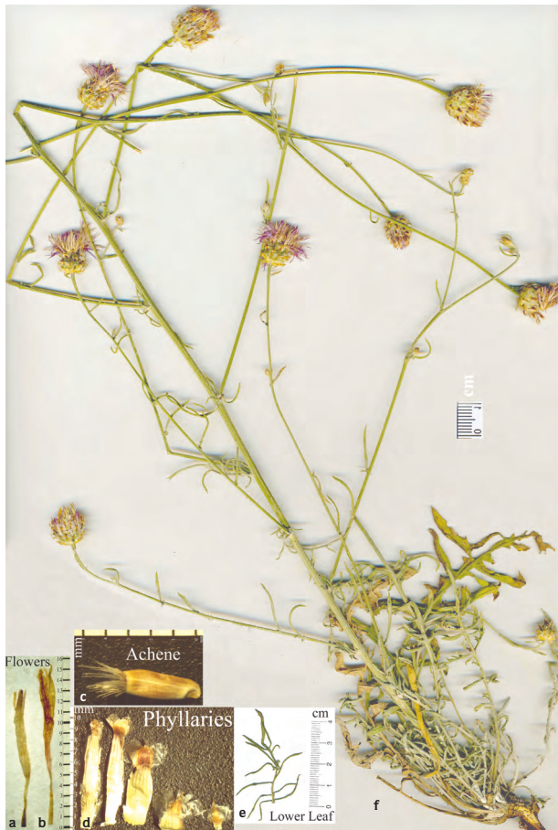
Figure 1. Centaurea aziziana . a. fertile flower; b. sterile flower; c. achene; d. phyllaries; e. lower leaf; f. habitus.