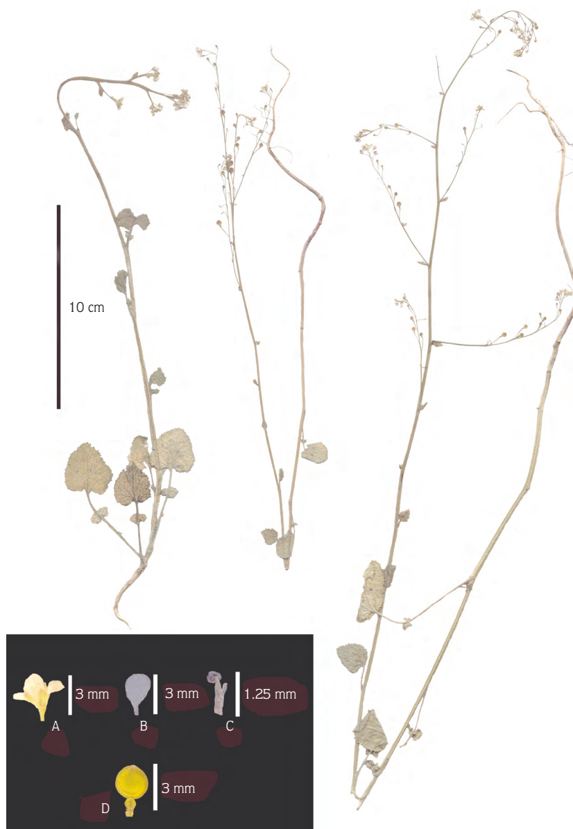
Figure 1. Crambe hispanica : A- Flower, B- Petal, C- Stamen (inner filament with teeth), D- Fruit.

The plant grows in the Mediterranean region of South Europe and North-west Africa (Portugal and Morocco to West Syria) (Tan, 2002). C. hispanica grows in a very limited area (in Turkey), where it is under high grazing pressure (Figure 2).