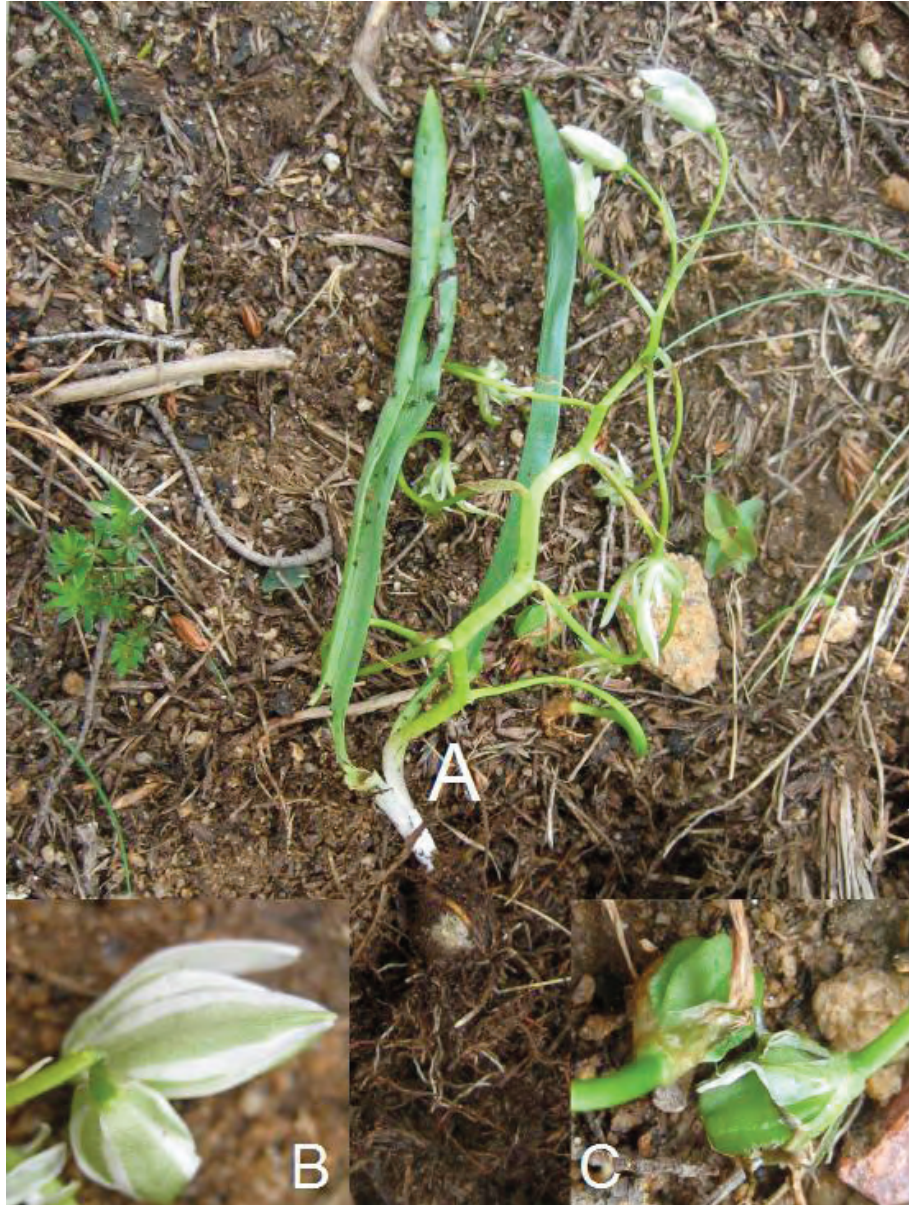
Figure 1. Ornithogalum nurdaniae sp. nov. (A), in the wild when flowering (B) and in the wild when in fruit (C).

In addition, scanning electron microscopy was used to examine the seed surface of the Ornithogalum species distributed in the Black Sea region of Turkey and Ornithogalum populations were investigated in terms of numerical taxonomy in the subgen. Ornithogalum , Syn: Subgen. Heliocharmos Baker. ( O. sigmoideum Freyn &