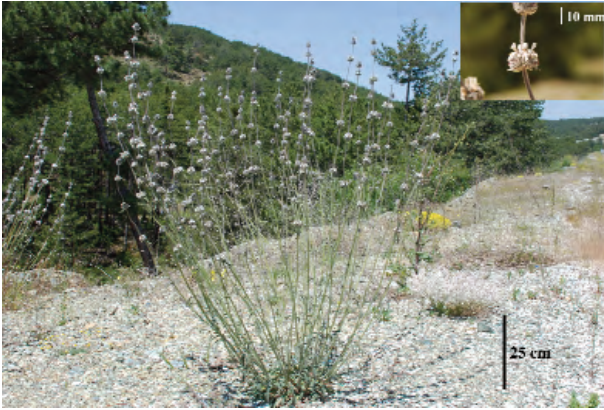
Figure 3. Stachys cretica subsp. kutahyensis : Habit and habitat photographs.

Diagnosis: Affinis S. cretica subsp. vacillans sed caulibus puberulis (non adpressis tomentoso-villosis vel lanato-villosis); foliis caulium 3-8(-9) mm (non 8-20 mm); dentibus calycum recurvis maturescentibus (non erectis vel recurvis leviter) et corollis albis (non purpureosubroseis) differt.