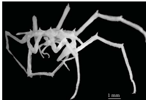
Figure 2. Ascorhynchus castelli (Dohrn, 1881) ♂, from İzmir Bay, dorsal view.

4 long and 6 short dorsal setae. Tarsus short, about 4.5 times shorter than propodus, with 1 dorsal seta, several ventral and lateral setae (Figure 3B). Palp with 10 segments, the 3rd segment longest, the 5th segment with a long lateral seta (longer than segment diameter) (Figure 3C). Ovipiger with 10 segments, the