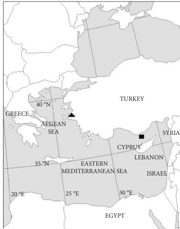
Figure 1. Earlier established occurrence of Ascorhynchus castelli (Dohrn, 1881) in the eastern Mediterranean Sea (filled rectangle) and the sampling area (filled triangle) reported in the present study.