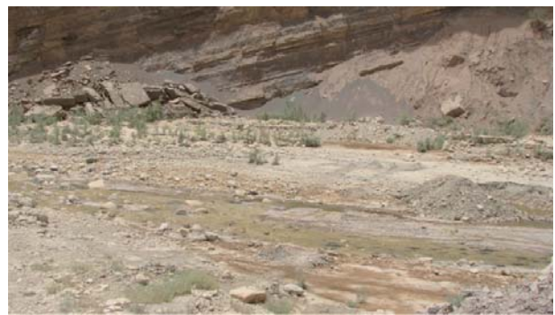
Figure 2. The collection site of A. d. dispar at Sartang-e Bijar River, Ilam, Iran.

The meristic characters of the studied specimens are shown in the following Table. All the meristics are in the range observed in other populations of A. d. dispar . The specimens ranged from 26.70 to 52.72 mm in total length. This species is distributed in almost all of the river estuaries of the Tigris to Makran basins that drain to the Persian Gulf and the Sea of Oman (Arvand Rud, Zohreh, Hendijan, Shapur, Dalaki, Helleh, Mond, Kul, Hasan Langi, Minab, Jagin, and Bahu Kalat rivers), the endorheic Jazmurian (Halil and Bampur rivers) and Mashkil basins, and Qeshm Island (Figure 3). However, this is the first report of a collection of this species in western Iran and at a latitude this high within its distribution range. This subspecies has been recorded from neighboring Pakistan, Arab countries on the southern Persian Gulf coasts, and Iraq (Coad, 2010). It has not yet been recorded from Turkey, as it is not included in Wildekamp et al. (1999); however, with more extensive field work it may be possible to find it there.