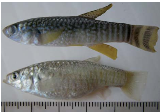
Figure 1. A pair of A. d. dispar individuals captured in Sartang-e Bijar River, Ilam, Iran.

Sartang-e Bijar is a short river originating in the Zagros Mountains. After running for about 20 km it enters Iraqi wetlands and finally reaches the Tigris River. The collection was made as part of a joint project of the Iran Environmental Protection Organization and Isfahan University of Technology, collection permission being granted by the former (No. 32/15827). A total of 101 specimens of A. d. dispar (Figure 1) were collected using a deep net with a 2-mm stretched mesh size; 20 specimens of each sex were used for the morphological study. The specimens were anesthetized with 1% clove oil solution, fixed in 10% formalin, and after a few days transferred to 70% ethanol. Collected specimens were cataloged in the fish collection of Isfahan University of Technology (IUT13880409-044-01). The procedures of Coad (1988; 1996) were followed for counts and