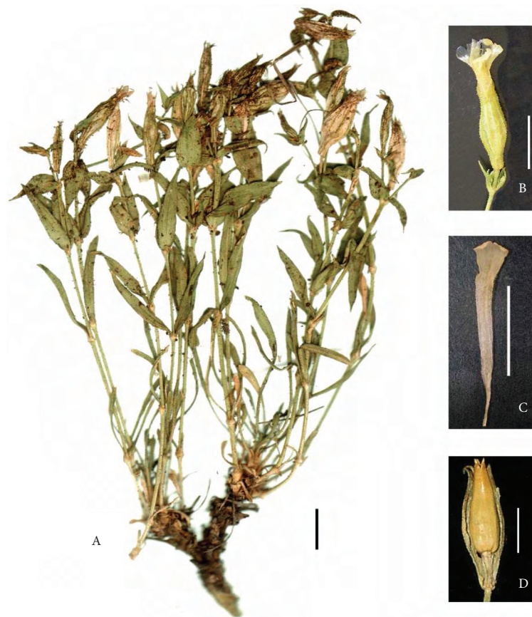
Figure 1. Silene gevasica ; A-Habit, B-Flower, C- Petal, D-Fruit and anthophore. (Scale bar: A-D = 1 cm).

Flowering stems 10-17 cm tall, ascending to erect, usually simple, 2-4-noded. Basal leaves linear-ob lanceolate, 10-65 × 1-8 mm, apex acute, base attenuate into short to long petiole, margin ciliate at base, 1-3-veined or venation obscure. Cauline leaves sessile, smaller than basal leaves, 3-5-veined, linear-lanceolate to ovate, 2-3-paired. Inflorescence usually lax compound dichasia, 3-7(-11)-flowered. Bracts similar to cauline leaves, lanceolate to ovate, ciliate at the base. Peduncles 9-21 mm long. Bracteoles similar to bracts, gradually smaller than bracts. Pedicels up to 8 mm. Calyx 10-nerved, 13-21 mm long, cylindrical-clavate in flower, elliptic-clavate and slightly constricted around the base of the capsule in fruit, greenish, densely glandular-hairy; teeth linear-lanceolate, 3-4 × 1.5-2 mm, apex acuminate, with broadly membranaceous margin. Anthophore 4-5.5 mm long, densely glandular-hairy. Petal yellowish-green, 13-19 mm long; limb broadly obovate, 5-6 mm