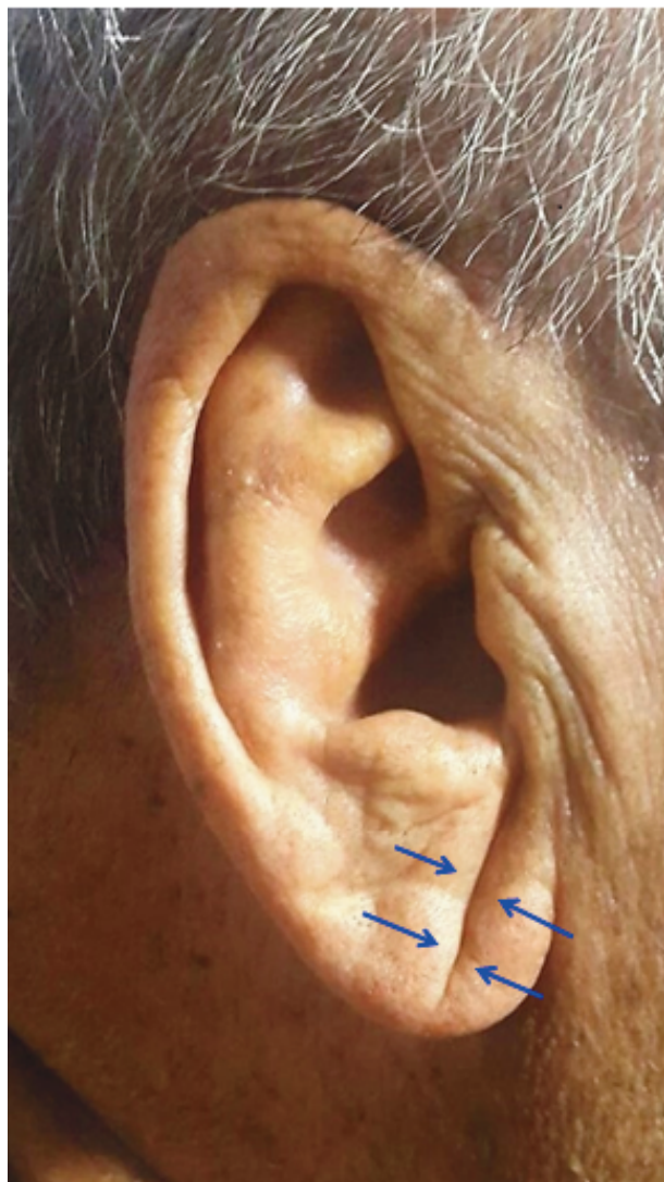
Figure 1. Earlobe crease (blue arrows).

This prospective study was designed according to the Helsinki Declaration and good clinical study guidelines. The individuals were examined with a 1.5 T magnetic resonance scanner (Siemens MAGNETOM Aera) in the department of radiology of a university hospital with routine clinical indications.