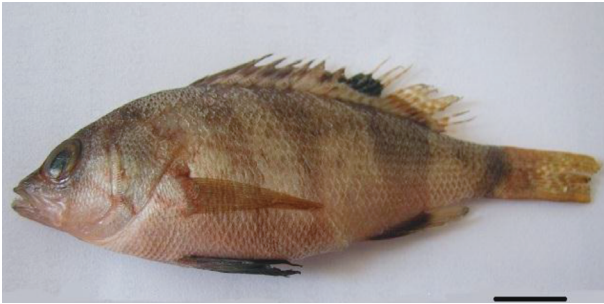
Figure 2. Specimen of Serranus hepatus captured off Şile in March 2012 (scale bar: 1 cm).

area, further confirmation is required to determine the significance of this observation. Additional records of S. hepatus from the Black Sea basin will answer the question of whether this occurrence is casual or whether it heralds a new range of the species.