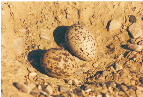
Figure 2. The nest of the Stone Curlew on bare ground in Nag Valley.

Curlew uses a little nest material in the United Kingdom and Spain, which is helpful in the concealment of the laid eggs, reducing predation. Perhaps in our study the stone mixed in the sand already provides good camouflage for the eggs; hence, the species did not use any nest material in the nest.