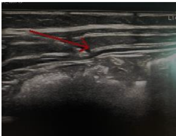
Figure 1. TAP block.