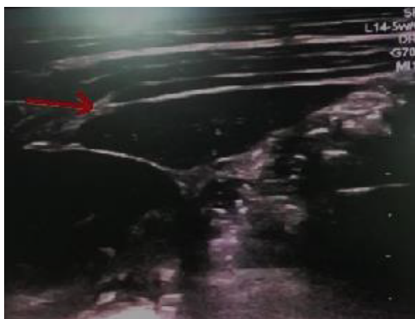
Figure 2. QL block.