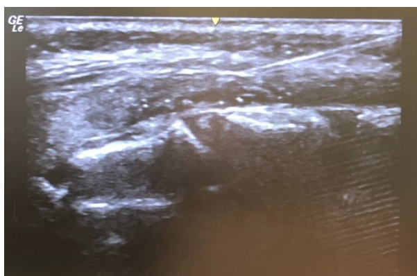
Figure 3. Caudal block.

assessment and were instructed to give 10 mg kg -1 of ibuprofen syrup to their children if they experienced pain at home.