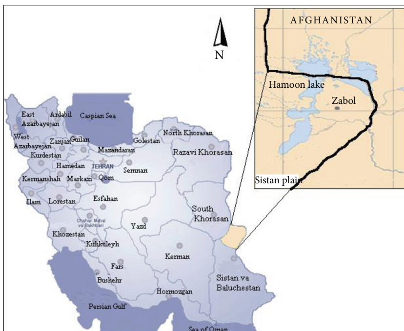
Figure 1. The location of study area.

The study was carried out on Sistan plain, south-eastern Iran. Sistan, with a total area of 8350 km 2 , lies between 60°36'18" and 61°48'24"E longitude and 30°32'3" and 31°32'50"N latitude (Figure 1). The mean elevation of the area is 480 m above msl. The climate was hyper-arid with mean annual precipitation and temperature of 60.8 mm and 22 °C, respectively. January and July were the months with mean minimum and maximum temperatures of -12 and 51 °C, respectively. Mean relative humidity