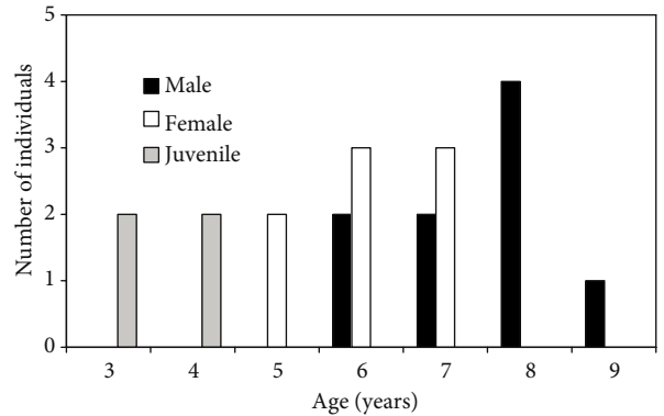
Figure 2. Age distribution of male, female, and juvenile Acanthodactylus boskianus .

Minimum ages were determined as 6 years for males and 5 years for females. Maximum ages were determined as 9 years for males and 7 years for females (Figure 2). The average ages of the males and females were calculated as 7.44 \pm 0.34 and 6.13 \pm 0.30 years, respectively (Table). Juveniles were from 3 to 4 years old. The difference in terms of age between the sexes was found statistically significant ( t = 2.906 , df = 15 , P = 0.011 ). The youngest female was 5 years old, the youngest male was 6 years old, and the oldest juvenile was 4 years old. We thus estimated age at maturity