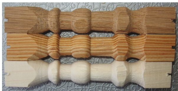
Figure 3. Turning test specimens (sessile oak, European black pine, black poplar).