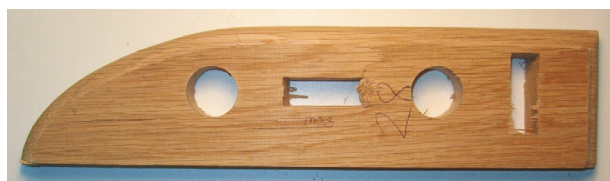
Figure 2. Test specimen (sessile oak) that is shaped, bored, and mortised.

was placed under each specimen to prevent damage on the outgoing side of the hollow chisel. The mortiser was equipped to produce a rectangular mortise. A turning test was performed with a single point lathe. The turning profile is referenced in the ASTM D 1666–87 standards. The rotational speed of the specimens on the single-point lathe was 2000 rpm. The initial dimensions of specimens were 1.9 \times 1.9 \times 12.7 cm. The machine permitted only manual feed by an authorized person. The rate, however, was kept uniform. Test specimens that were shaped, bored, and mortised are shown in Figure 2 and turning test specimens are shown in Figure 3.