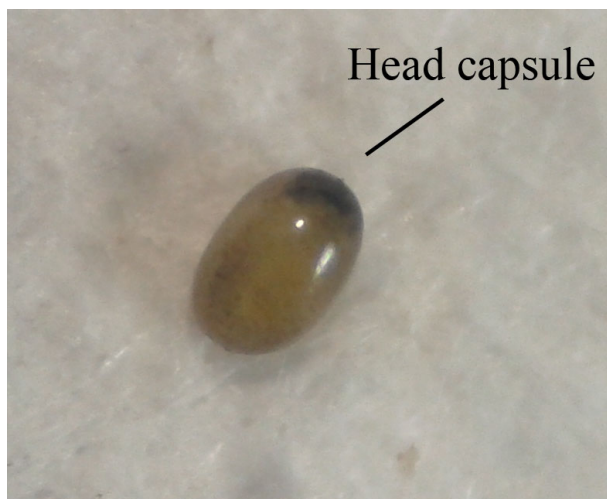
Figure 3. Unhatched egg from Jovein population. Head capsule showed embryo movement until day 14.

population (Jovein), 10 eggs remained unhatched for a long time with an unusual feature. The black head capsule clearly showed embryo movement in these 10 eggs (Figure 3). No deformation, change in color, or wizeness was observed for about 14 days (similar to the movement when larvae going to hatch). Only 1 egg hatched normally like in the western populations in 8 days. This abnormality may be related to a genetic disorder or pathogens that had infected only the Jovein population. Although it is possible that this inefficient hatching of eggs resulted from environmental pathogens, all specimens were kept in the same conditions with the same feeding habits in sterile germinators, so we assume a genetic disorder for the Jovein population. For finding a more logical explanation, more research is suggested.