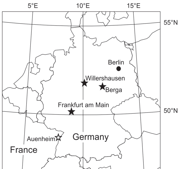
Figure 1. Map showing the geographic position of the three floras investigated in the present study (black stars), as well as the Auenheim locality that has been included for comparison (open star).

& Gregor (2000) and Gregor & Storch (2000). From these works it became evident that the flora represents a Mixed Mesophytic forest. The climate of Willershausen has previously been interpreted as Cfa-type sensu Köppen (with tendency to Cfb-type) with mean annual temperature (MAT) 11–13°C, mean temperature of the coldest month (CMMT) 5–9°C, mean temperature of the warmest month (WMMT) ~ 25°C and mean annual precipitation (MAP) >1000 mm (Gregor & Storch 2000). Due to the absence of Viscum , Ferguson & Knobloch (1998) suggested oceanic climate conditions with rather cool WMMT (13–17°C) and mild winters with CMMT above freezing point, i.e. similar to present day conditions. Annual precipitation was estimated at 800–1400 mm. Recently, MAT values derived from different techniques have been presented in by Uhl et al. (2007b) (cf. Table 1).