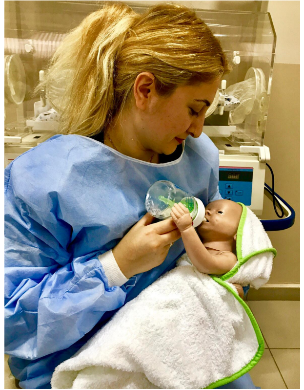
Figure 3. The control group.

breastfeeding counselling to breastfeed and/or provide human milk during this period [15,16]. It may be necessary to support both the newborn, who struggles with grasping the nipple, and the mother, utilizing the necessary means (i.e. supplementary feeding/supplementation tools), in order to ensure a compatible breastfeeding period [16]. Breastfeeding, then, is primarily recommended when the preterm infants are thought to be ready to be fed orally 22 . However, given that preterm infants are generally unsuccessful at terms of sucking and taking the human milk during their initial breastfeeding experienced in their mothers' breast, it is required to support sucking behaviors with different feeding methods [17].