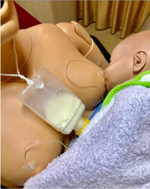
Figure 2. The study group.