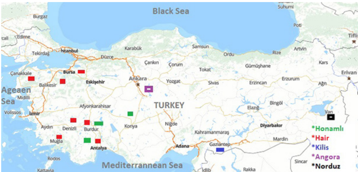
Figure 1. Locations of samples collected during the experiment in Turkey (Hair, Honamlı, Kilis, Angora and Norduz goat). The map should be downloaded from the Republic of Turkey, General Directorate of Mapping and the related reference should be given here as a footnote.

Primer sequences of KAP1.1 F: 5'-CAACCCTCCTCTCAACCCAACTCC-3', R: 5'-CGTGCTACCCACCTGGCCATA-3' [10], KAP1.3 F: 5'- CAAGCAGACCAAACCTCAGAAAC-3', R: 5'-TGTCACAGTAGGATGGGCGGC -3' [16] and K33