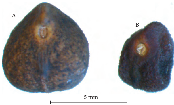
Figure 2. Seeds of C. uludereensis (A; from A.A.Dönmez 15478) and C. isauricum (B; from H.Peşmen 2233).