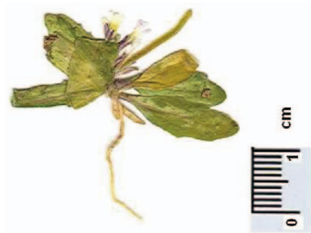
Figure 1. Malcolmia intermedia C.A.Mey.

Malcolmia intermedia C.A.Mey., Verz. Pflanz. Cauc.: 186 (1831). (Figure 1).