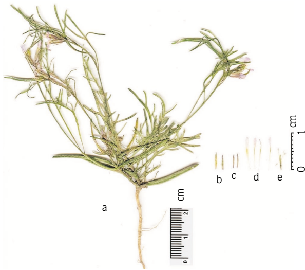
Figure 2. Leptaleum filiforme (Willd.) DC. a. habit; b. outer sepals; c. inner sepals; d. petals; e. stamens and ovary.

Annual, divaricately branching from base, 2-10 cm; branches, fruit and pedicels sparingly to densely furnished with simple or furcate whitish hairs, plant otherwise glabrous or almost so. Lower leaves up to c. 2 cm, often simple and filiform, the upper usually simply pinnate with long, filiform segments. Flowers white, later pink, solitary in the axils of all the leaves (even those at the extreme base), or in very short axillary racemes of up to 3 flowers; pedicels 2-3 mm. Sepals erect, c. 5 mm. pale-margined. Petals linear-oblongate, c. 9-10 mm, apex rounded. Siliqua linear, compressed, 17-30 x 2 mm; suture prominent and smooth; valves reticulate-smooth,