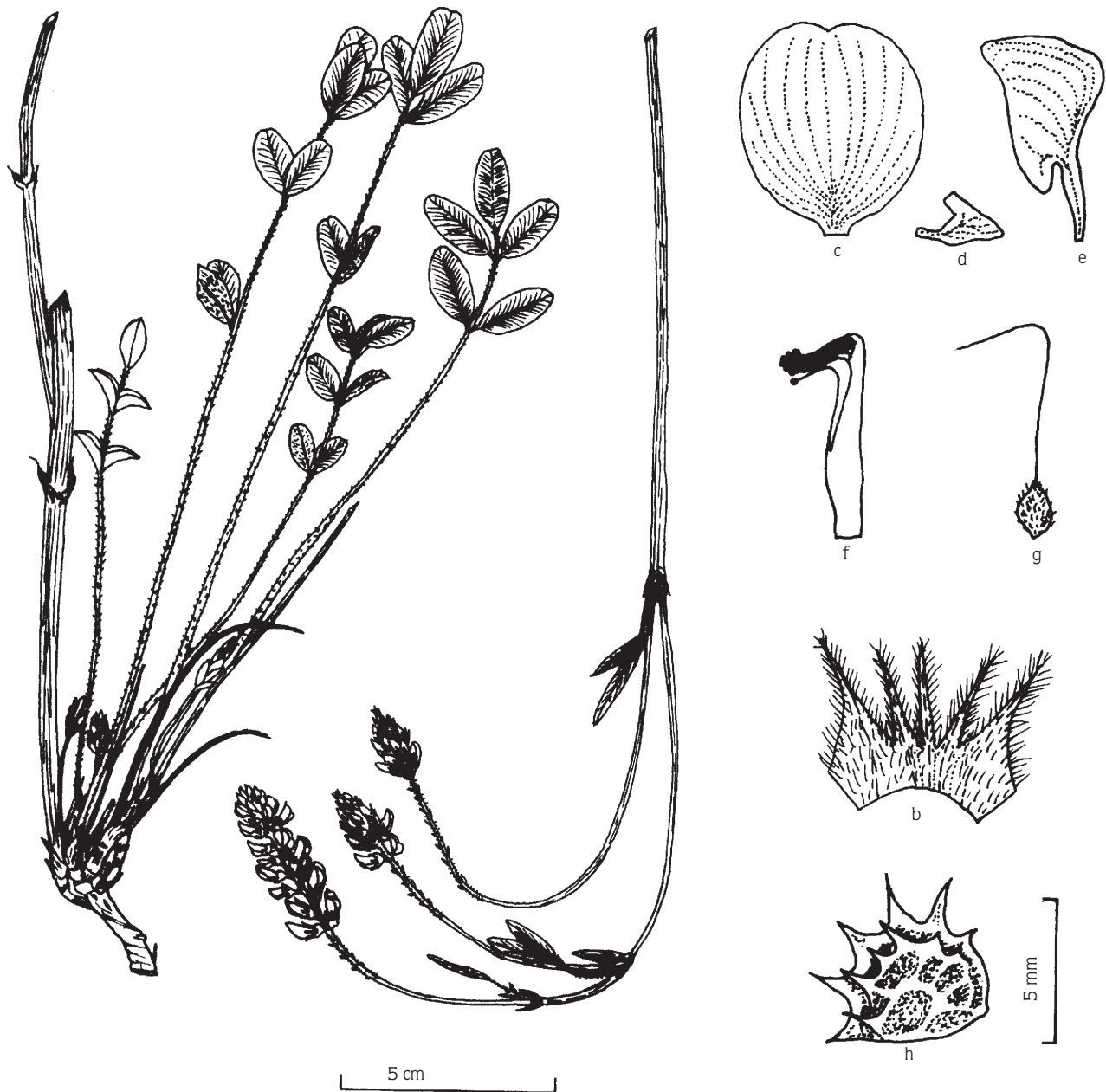
Figure 1. Onobrychis fallax var. longifolia : a. habitus, b. calyx, c. standard, d. wing, e. keel, f. stamens, g. ovary, h. fruit.

These varieties can be keyed out as follows: