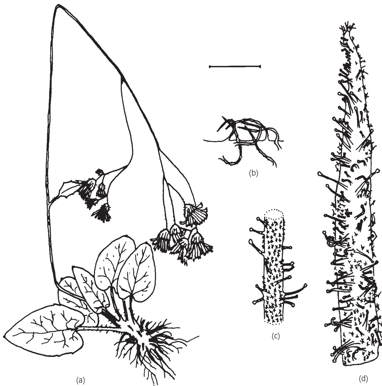
Figure 1. H. cardiophyllum . a-general view of the plant, b-leaf margin, c-peduncle, d-phyllary. Scale bar: a-10 cm, b,c,d-1mm.

eglandular hairs, moderately glandular (70-80 in number) and more or less stellate-pubescent along margins. Ligules glabrous at apex. Styles yellow to dark yellow. Achenes c. 3 mm, brown to dark brown. Flowering July - August. Banks and roadside.