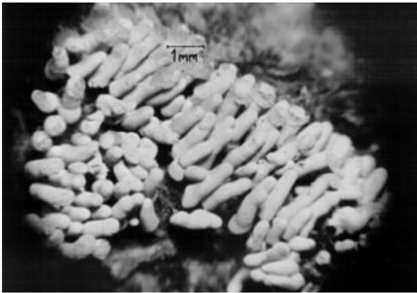
Figure 1. Stereomicroscopic appearance of the sporangia of Arcyria minuta Buchet.