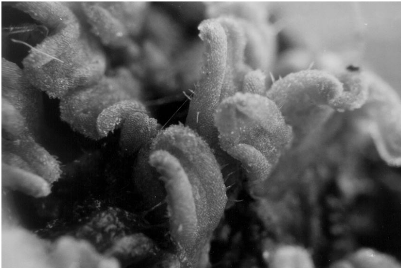
Figure 2. General view of Riccia crozalsii specimens (X24).

covered with fine tubercles. Ventral scales colourless to purplish, soon vanishing. Plant monoecious, capsules very common in winter to spring. Spores dark brown to black, 65-105 \mu\text{m} ., convex (distal) face with 6-8 areolae, 12-18 \mu\text{m} . wide, truncate tubercles present at corners of areolae, triradiate (proximal) face with smaller areolae,