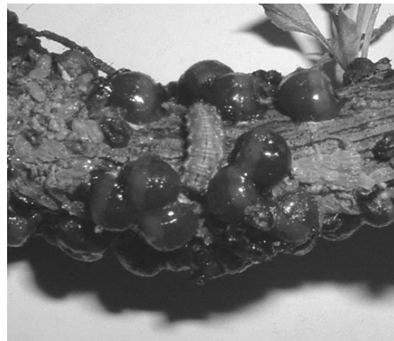
Figure 2. Larvae of Eupeodes corollae feeding on larvae of Parthenolecanium persicae .