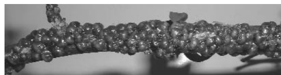
Figure 1. Parthenolecanium persicae on the branches of almond trees.