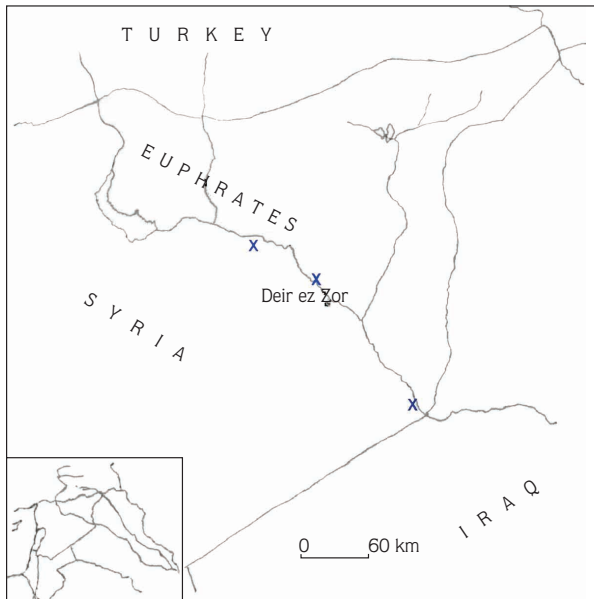
Figure 1. Sampling sites in the intermediate reaches of the Euphrates River.

with transmitted light. Sex was determined for most samples by examining gonad tissues either macroscopically or after dissection and examining tissues under a stereomicroscope for smaller individuals. The sex ratio was tested by the chi-square test to indicate whether there was a deviation from a 1:1 ratio.