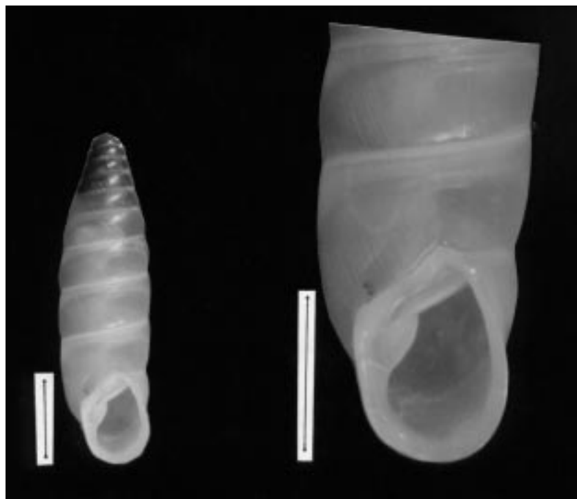
Figure 2. Buliminus gallandi , specimen from Sariköy köyü, Mardin-Turkey. Scale bar= 5 mm, photo: B. Graack.

We thank Miss Brigitte Graack, Wedemark, Germany, for the photo graphs (Fig. 2).