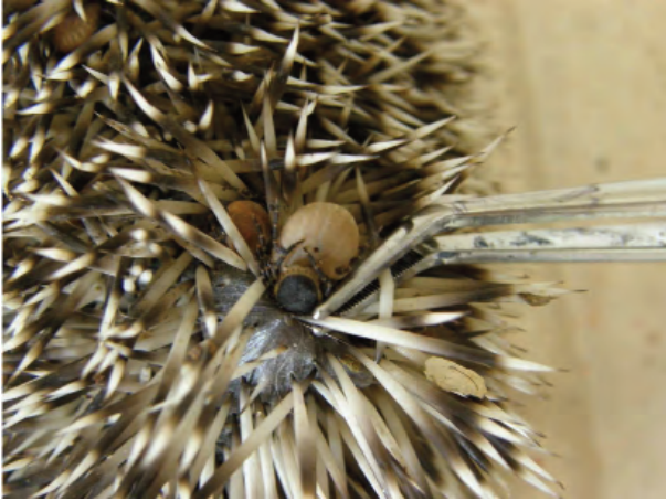
Figure 3. Mating adult Hyalomma aegyptium on the young hedgehog.

17). In addition, this tick was only reported from Testudo graeca in Iran (4).