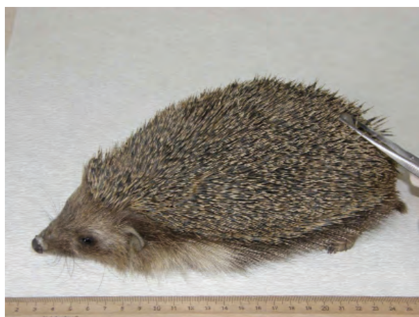
Figure 1. A female adult tick collected from the soft skin under the spines of hip of the adult hedgehog.

Hyalomma aegyptium has been commonly recorded on cattle and buffaloes from Balkan countries, Pakistan, Russia, India, and southern Marmara Region of Turkey by various authors (15-