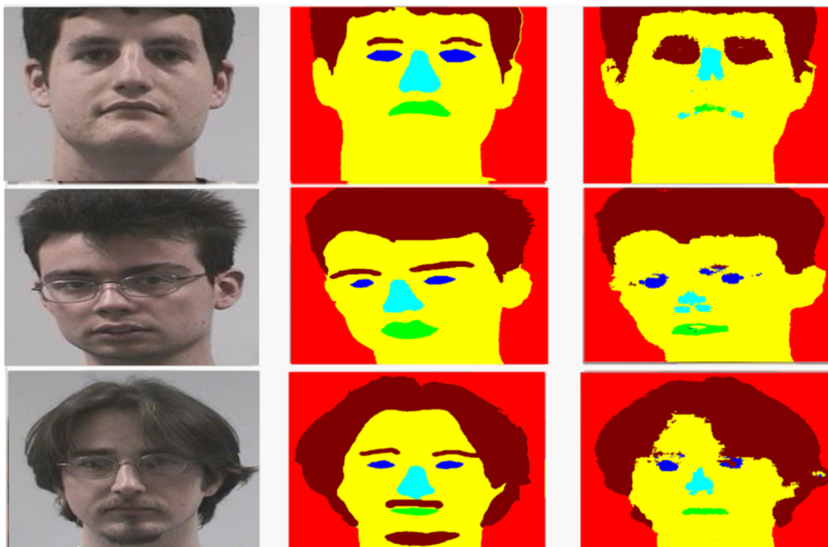
Figure 2. Images from the FASSEG V-4 database. First column shows original RGB images, second column shows ground truth images, and third column shows results obtained with the proposed MSS-CRF (poor segmentation results).