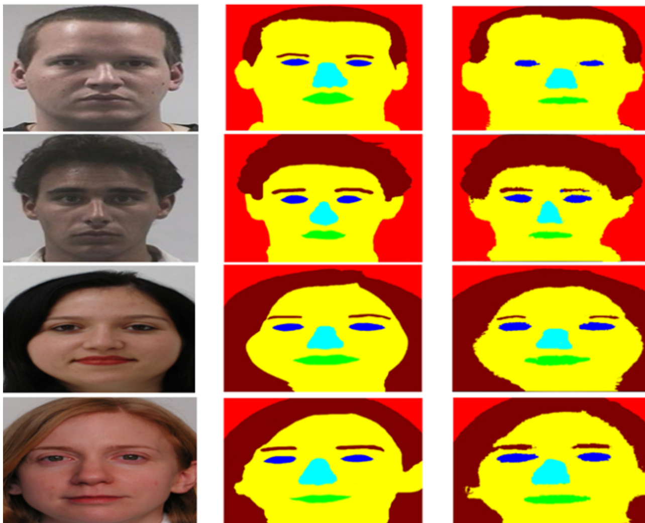
Figure 1. Images from the FASSEG V-4 database. First column shows original RGB images, second column shows ground truth images, and third column shows results obtained with the proposed MSS-CRF (better segmentation results).

the same class label. A single CPU (2.8 GHz Core i7 and 8 GB RAM) was used, without any GPU or dedicated hardware. A single 520 \times 480 pixel image was divided into superpixels in 1.51 s with SEEDS.